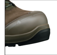
HAIX® Nano-Carbon Toe Cap