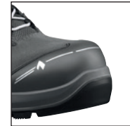
HAIX® Nano-Carbon Toe Cap