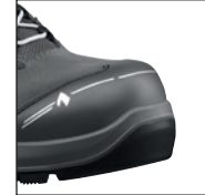
HAIX® Nano-Carbon Toe Cap