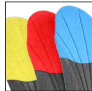
HAIX® Vario Wide Fit System