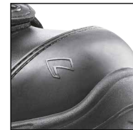
HAIX® Composite toe cap